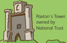
Paxton's Tower owned by National Trust